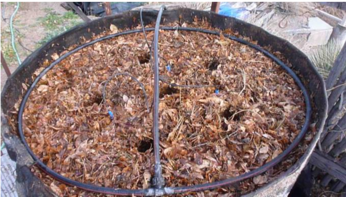
Figure 8. Irrigation System for a Johnson-Su Composting Bioreactor

To irrigate the system, I use a circular piece of \frac{1}{2} " landscape hose that snakes around the top perimeter of the bioreactor (Figure 8). I drill \frac{1}{16} " holes into the bottom of the hose every 4-5", and also I drill some holes horizontally in the hose about every 6". The horizontal holes spray towards the center of the bioreactor to thoroughly wet all the material. I connect the ends of this hose with a plastic landscape T-hose fitting that has two \frac{1}{2} " female push-compression fittings and a female hose-bib thread (Figure 9). Once the water has been sprayed onto the top of the compost substrate, gravity will pull the water from the top of the pile into the rest of the compost substrate.