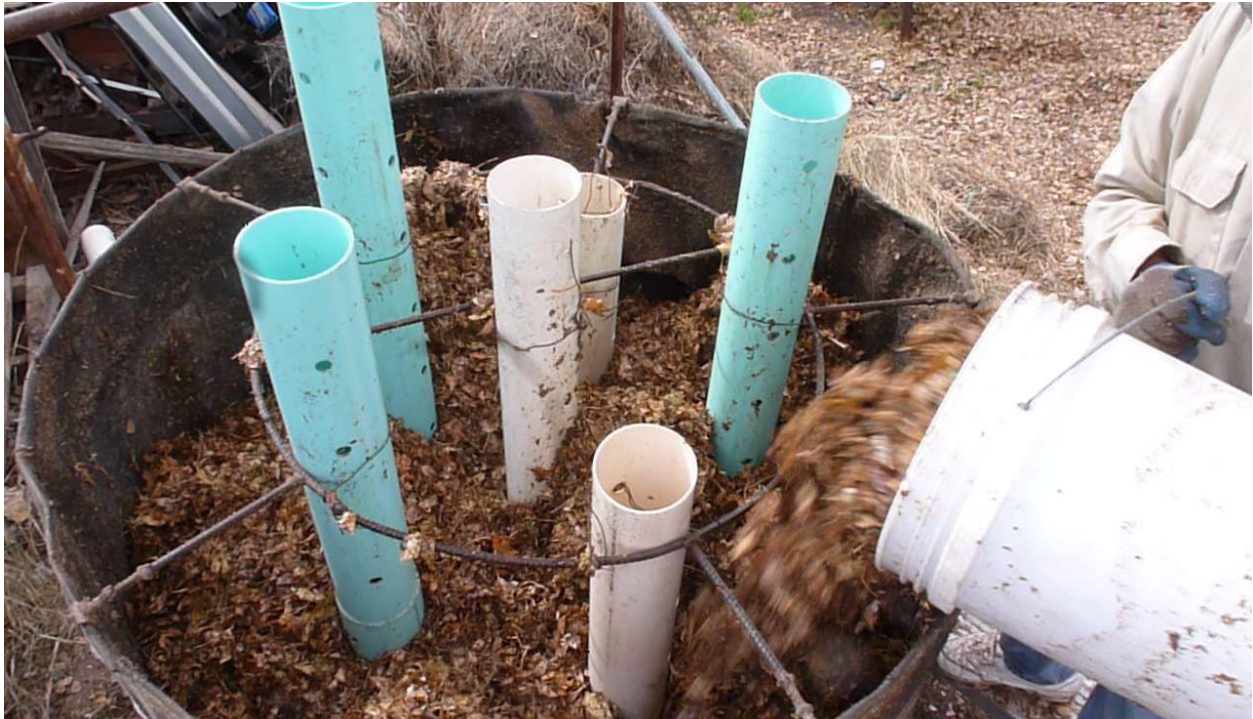
Figure 7. Filling the Bioreactor

Typically, I fill 6-9 buckets with wetted compost, dump each of these buckets into the bioreactor, then fill another 6-9 buckets and repeat the process.