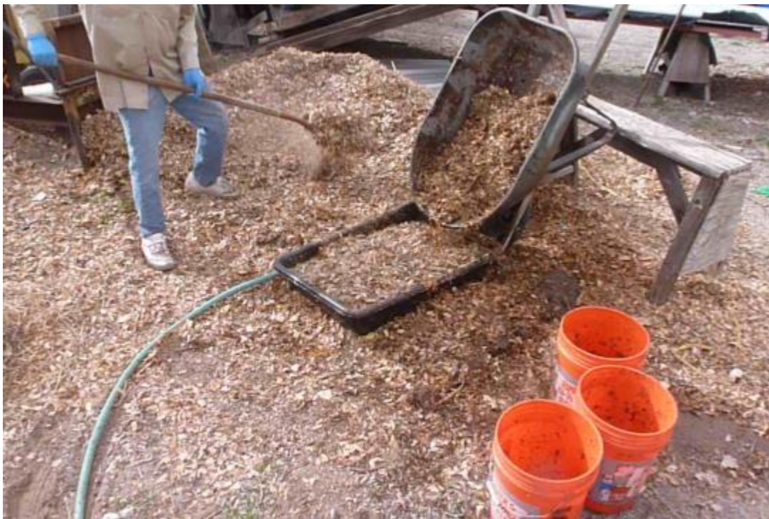
Figure 6. Setup for Wetting Feed Materials

Once the feed materials are thoroughly wet, I use a pitchfork to lift them into a wheelbarrow that is braced into a tilted position (Figure 6) so that water can drain off of the feed material and back into the water-bath tray. This uses the water efficiently.