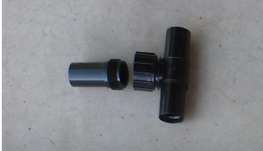
Figure 9. T-hose Fitting for the Irrigation System

The irrigation system adds sufficient water to the bioreactor when attached to a garden hose or typical ½” landscape irrigation hose with water pressure between 30-50 psi. It is best to hook this hose up to a timed sprinkler system (timed to irrigate the reactor 1 minute/day, or 2 minutes/day in temperatures above 100 °F) to ensure that the pile has adequate water and is not allowed to dry out.