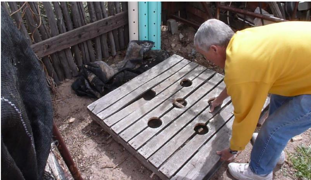
Figure 3. Positioning of Holes in Pallet

The pallet serves as the base for the Johnson-Su bioreactor, and it supports both the remesh/groundcloth cylinder and the septic system drain field pipes. To let the pallet hold the pipes in place, you'll use a jigsaw to cut six 4 3/8" holes in the top of the pallet (as shown in Figure 3).