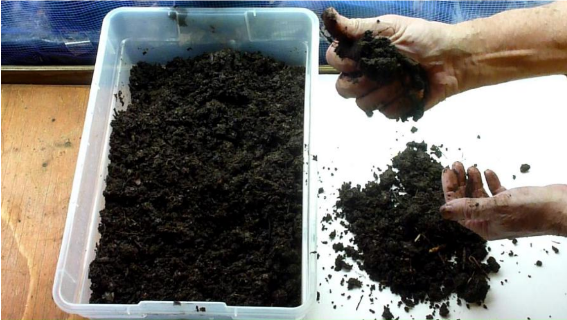
Figure 10. Mature Compost from a Johnson-Su Bioreactor. See also the video at https://www.dropbox.com/s/2fhy9zex8f3345j/P1040302.MOV?dl=0 .

After a composting period of 9 months to a year, the compost product from a Johnson-Su bioreactor (Figure 10) can be used as it is, made into a slurry to coat seeds, or used to make an extract that can be sprayed on a field or into the furrow as you plant seeds.