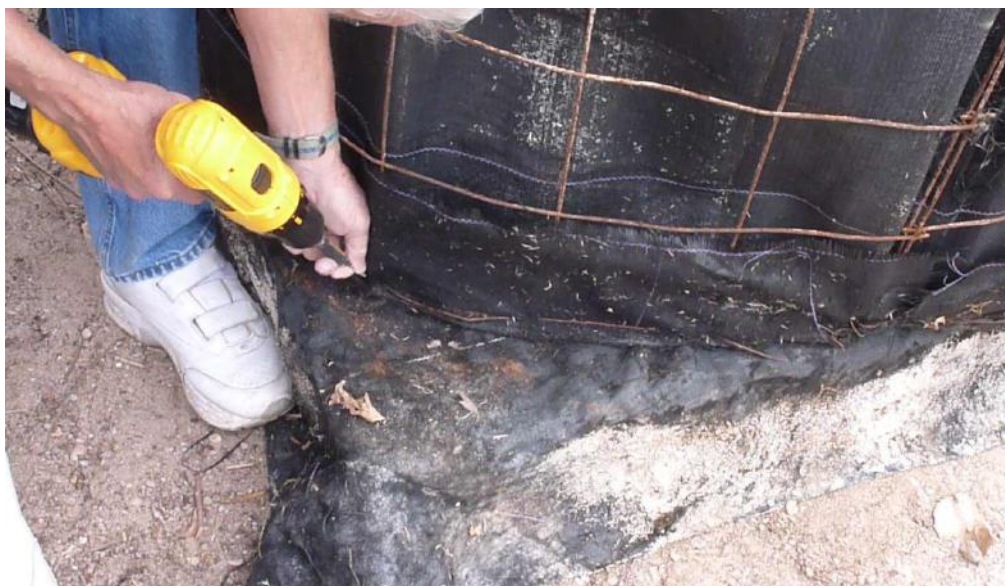
Figure 5. Screwing the Base of the Cage to the Pallet