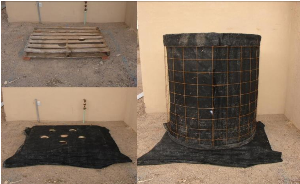
Figure 2. A Johnson-Su Composting Bioreactor

After you build a Johnson-Su bioreactor (Figure 2), you can reuse it many times.